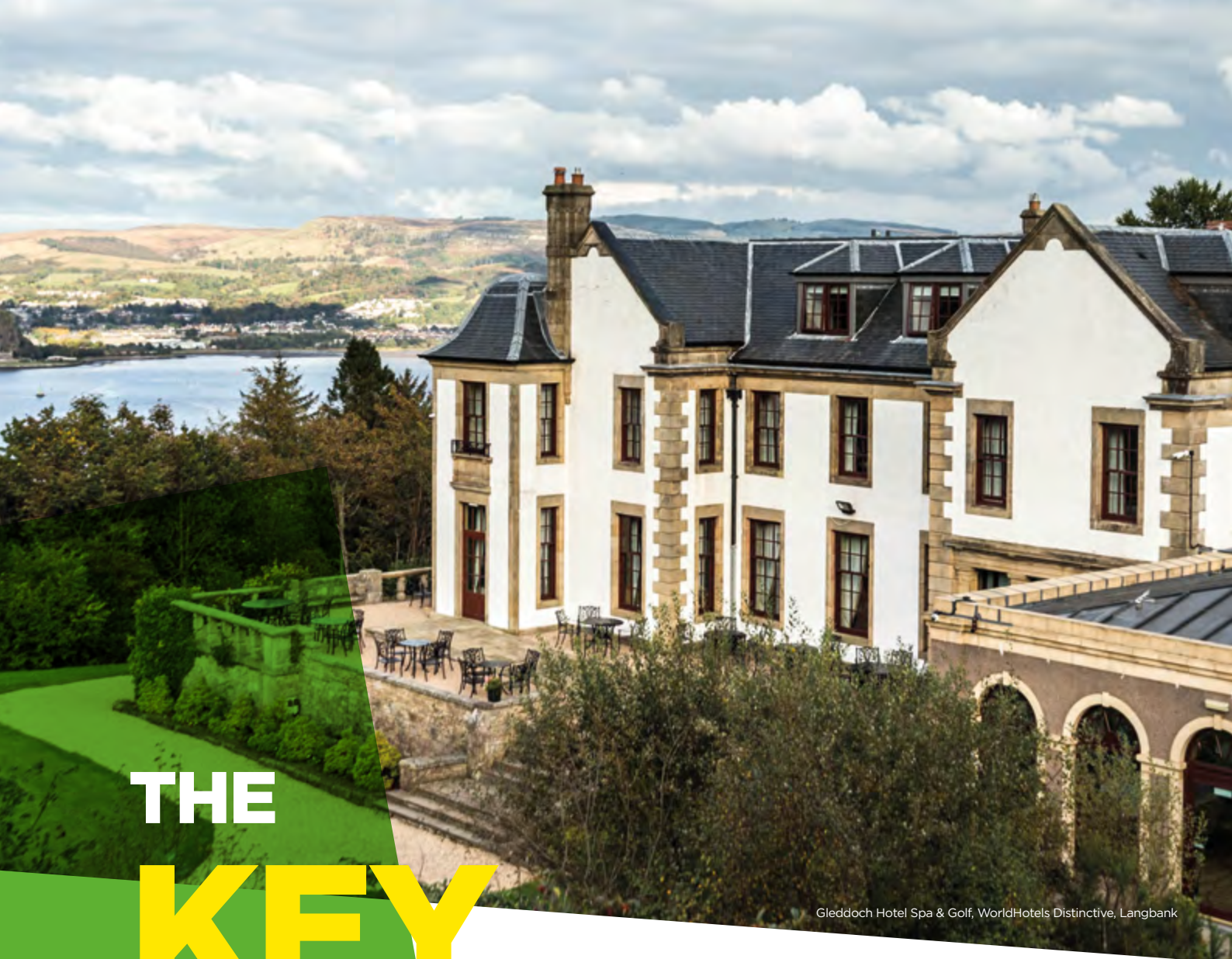
Gleddoch Hotel Spa & Golf, WorldHotels Distinctive, Langbank